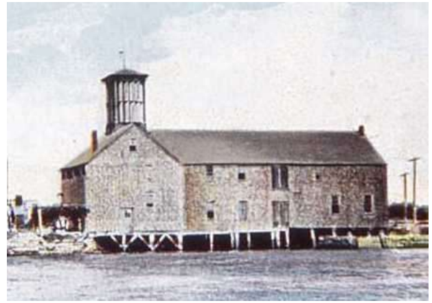
The Fickett tidal and wind-powered grist mill at Stroudwater from an old postcard

To register: call 207-946-4156 or email either budw@fairpoint.net or info@tidemillinstitute.org .